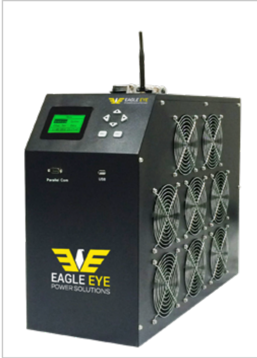
SLB-Series DC Load Bank