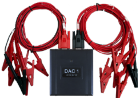
Data Acquisition Case (DAC)

Eagle Eye's SLB-Series Load Banks come with an optional DAC package allowing the voltage of EACH CELL to be wirelessly monitored and recorded during discharge. The DAC package allows the user to evaluate the health of each cell and replace only the cells that require replacement - saving time and money by significantly reducing labor hours and replacement costs.