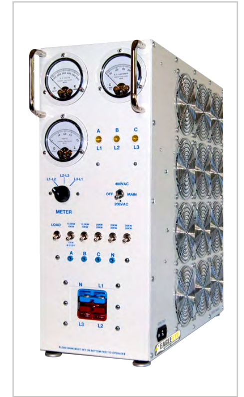
LB-60-100 AC Load Bank