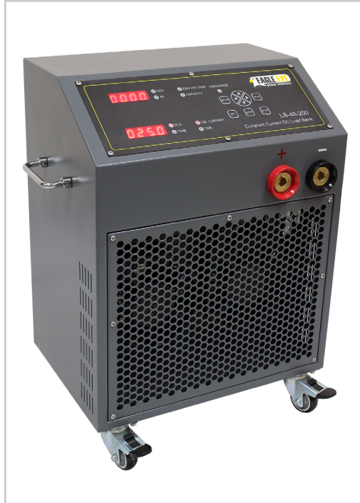
LB-Series CC Load Bank