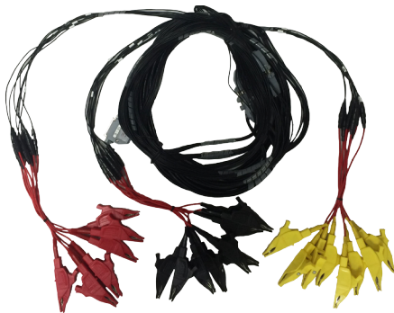
Cell Monitoring Harnesses

In addition to the base CC model, we offer 2 additional model packages that incorporate added features to suit the full range of our customer needs. These advanced models provide the standard CC features PLUS Data Management software, PER CELL monitoring, LCD screen, data storage, and programmable load steps. Please see model chart breakdown for details.