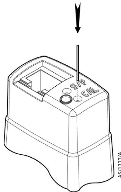
Figure 2 - Adjustment of APG100