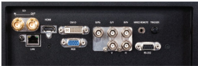
Includes a full complement of connections, including network control.

EIKI® is a registered trademark of EIKI International, Inc. Kensington® is a registered trademark of ACCO Brands Corporation.