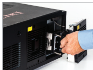
Easy to change long-life lamp.