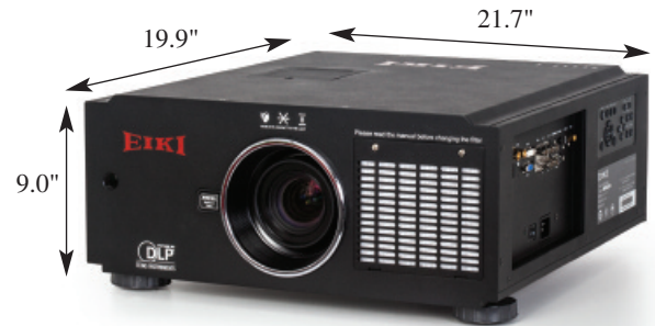
EIP-UHS100 • WUXGA projector.