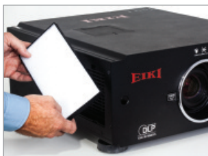
Handy access to air filter.