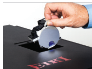
Easy access to color wheel.