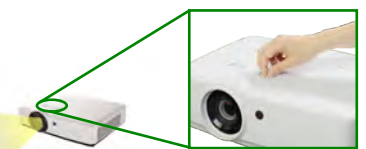
Curved Correction (EK-307W only)