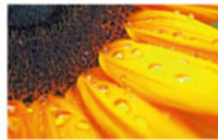
ColorSpark HLD LED