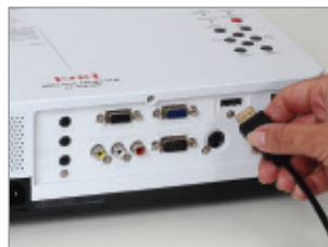
Connect and project.