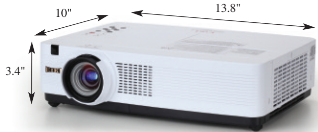
LC-WB200A • WXGA projector