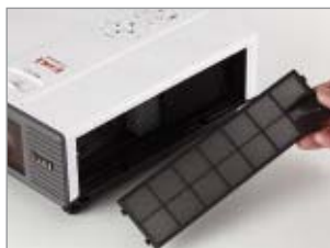
Handy access to air filter.