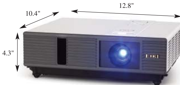
LC-WNB3000N, LC-XNB3500N, LC-XNB4000N • XGA projector.