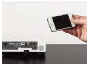
Wireless access with mobile terminal.