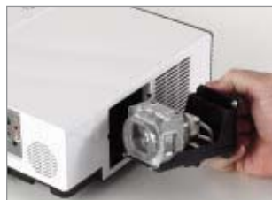
Easy to change long-life lamp.