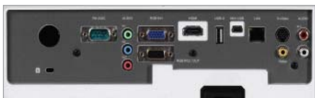
Includes a full complement of connections, including network control.

EIKI® is a registered trademark of Eiki International, Inc. Kensington® is a registered trademark of ACCO Brands Corporation.