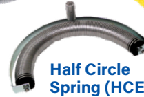
Half Circle Spring (HCE)