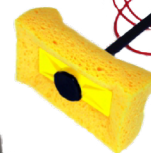
8" Sponge Electrode