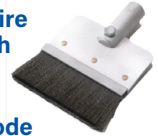
6" Wire Brush