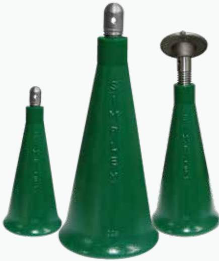
Tank Jack Family Shown

Capacity .....▶ 7.5 tons Stroke .....▶ 2 in. Minimum Height .....▶ 6 - 18 in.