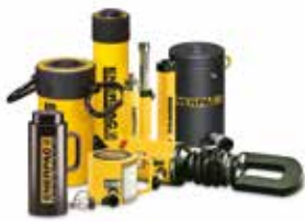
Cylinders & Lifting Products