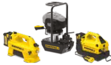
Cordless Hydraulic Pumps