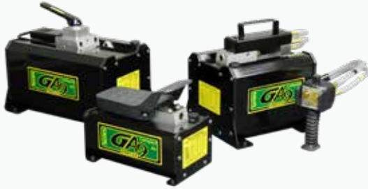
Air Foot Pump Family Shown

Usable Oil Capacity .....▶ 90 - 460 cu.in.