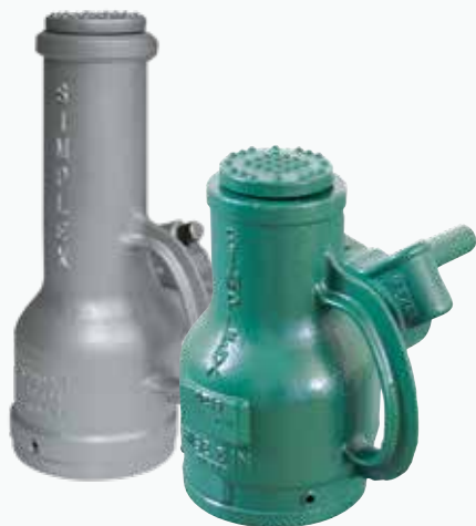
JJA2515C, JJ2510C Shown

Capacity Range .....▶ 15 - 50 tons Stroke Range .....▶ 4 - 9 in. Minimum Height .....▶ 10.25 - 15 in.