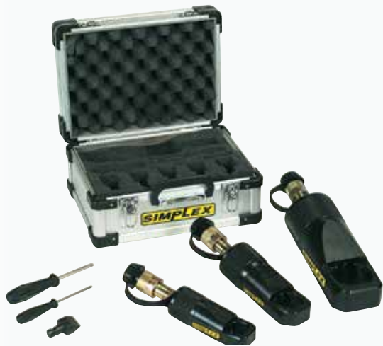
NS Series Shown

Nut Range .....▶ .5 - 2.88 in. Weight .....▶ 1.8 - 75.1 lbs. Maximum Pressure .....▶ 10,000 psi