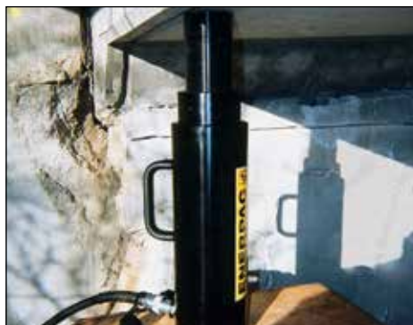
◀ The portable Lock Nut cylinder RACL1506 used for extended load support during epoxy injection for bridge reinforcement.