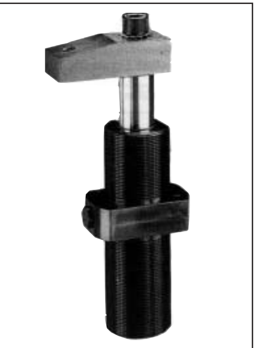
Figure 1: SC-1 Swing Clamps