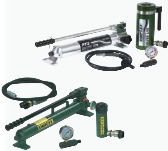
ST106A Set Shown

Capacity Range .....▶ 10 - 100 tons Stroke Range .....▶ 1.5 - 14.25 in. Maximum Pressure .....▶ 10,000 psi