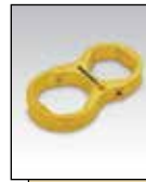
STTLR for RSQ-Series Spline Fitting