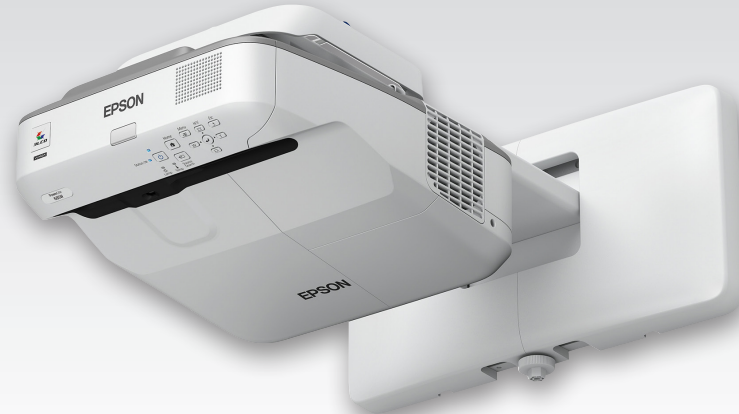
Shown with optional wall mount (sold separately)