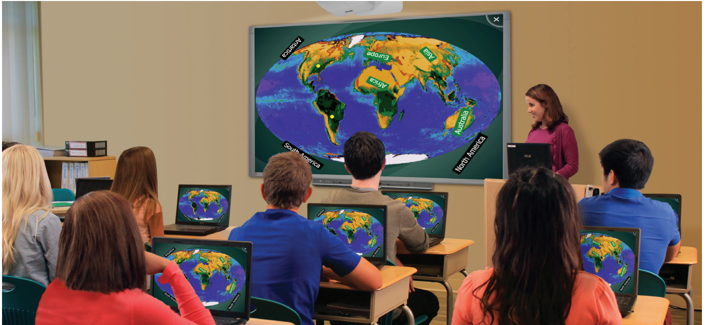
Note: Projected image simulated.