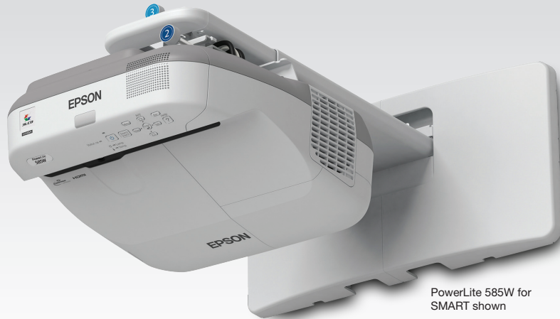
PowerLite 585W for SMART shown

WXGA resolution For SMART Board M685 and 885 87" maximum image size