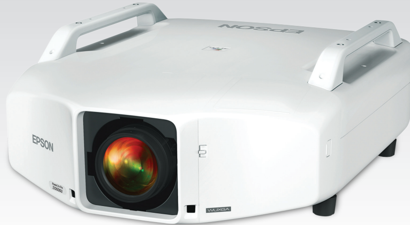
Projector shown with lens. Lens sold separately.