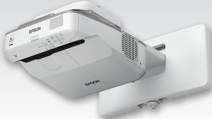
Shown with optional wall mount (sold separately)