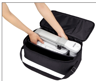
Carrying case included.