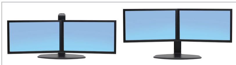
Neo-Flex Dual Lift Stand supports two displays up to 24" each and provides lift of 5" (13 cm)