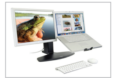
Neo-Flex Combo Lift Stand supports a display next to a laptop computer, positioned on the left or right side. Use with a separate keyboard and mouse (not included)