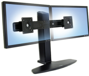
Neo-Flex Dual LCD Lift Stand