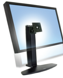
Neo-Flex Widescreen Lift Stand