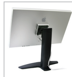
Neo-Flex Widescreen Lift Stand supports a large display up to 32" and provides lift of 5" (13 cm)