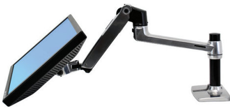
Ideal for users who wear bifocals