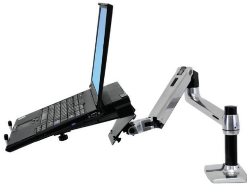
Add Notebook Tray (ordered separately, 50-193-200) to hold a laptop