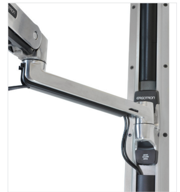
RECOMMENDED: ATTACH WALL MOUNT ARM TO AN ERGOTRON WALL TRACK USING BRACKET (#97-091)