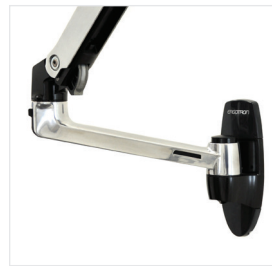
LX EXTENSION (#45-289-026) INCREASES REACH BY 9" (23 CM)