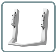
RECOMMENDED ACCESSORY: LX DUAL DIRECT HANDLE KIT 98-037-062