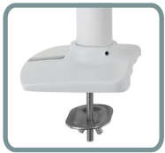
GROMMET MOUNT KIT ACCESSORY 98-034: ATTACHES THROUGH SURFACE HOLE