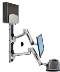
LX Sit-Stand Wall Mount System