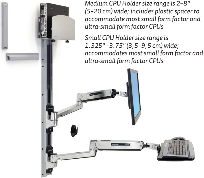
LX Sit-Stand Wall Mount System shown with Medium CPU Holder