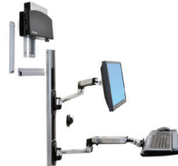
LX Wall Mount System