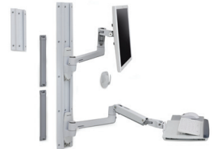
LX Wall Mount System, White