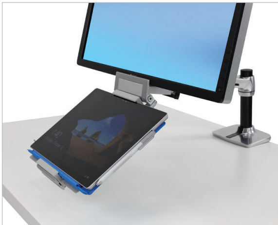
Achieve a 60° tilt range when tablet is mounted below the monitor