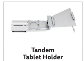
Tandem Tablet Holder