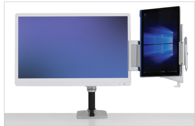
The tablet easel can be installed below or on either side of your monitor. The holder assembly easily attaches to the VESA plate of your monitor mount