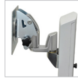
SV Cart LCD Pan Pivot Kit 97-650

Always responding to fit your ever-changing workflows