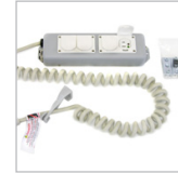
Medical-Grade Power Strip 97-466-214 (Available North America)