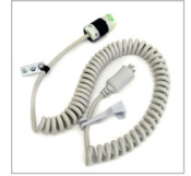
Coiled Extension Cord Accessory Kit 97-464 (Available North America)