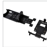
Universal Tablet Cradle 80-106-085