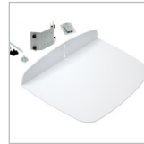
Utility Shelf 97-507-216