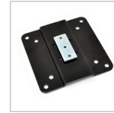
SV Rear VESA Mount Kit 97-512-009