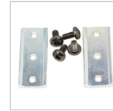
SV T-Nut Kit 97-631