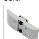
T-Slot Bracket 60-575-003