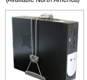
Universal CPU Holder 80-105-064 See website for complete cart accessories and general accessories list