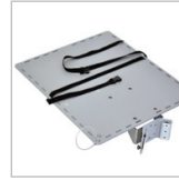
Large Utility Shelf 97-540-053