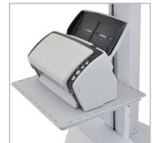
SV cart with scanner/printer placed on Ergotron's Large Utility Shelf 97-540-053 and attached with the T-Slot Bracket 60-575-003