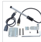
Task Light 97-754-002