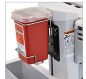
SV cart with small Sharps container and wall mount bracket attached via Ergotron's VESA Mount Kit 97-512-009