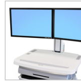
SV Dual Display Kit 97-574