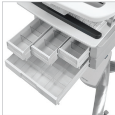
SEVERAL DRAWER CONFIGURATIONS