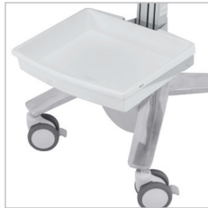
SV FRONT TRAY