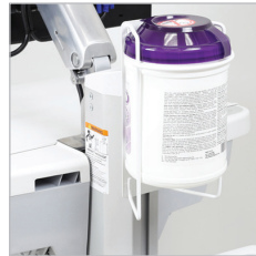
SV SANI-WIPES HOLDER