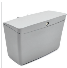
SV STORAGE BIN