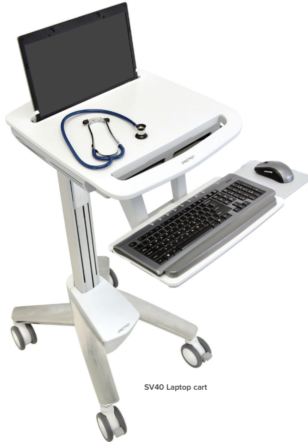
SV40 Laptop cart