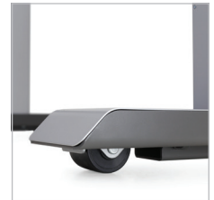
Tilt-and-go rear wheels help you easily move the table for cleaning or accessing the cable tray