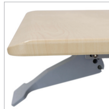
Adjust the main worksurface 31.3-51.3" high (79,5-130,3 cm) with the simple squeeze of a lever