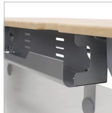
The 6.5" high (16.5 cm) cable tray is deep enough to hold all your power bricks and cord bundles