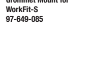
Grommet Mount for WorkFit-S 97-649-085