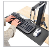
Large Keyboard Tray for WorkFit-S 97-653 (black)