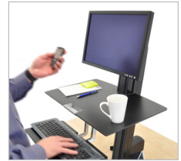
Worksurface for WorkFit-S 97-581-019 (black)

This kit converts a WorkFit-S, WorkFit-C or WorkFit-A Dual Workstation into a WorkFit LCD & Laptop Workstation