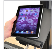
Tablet/Document Holder for WorkFit-S 97-558-200 (black) Includes lift handle