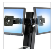
Hinged Bow for WorkFit-S 97-583-009 (black)