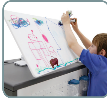
98-408-896 VESA MOUNT WHITEBOARD