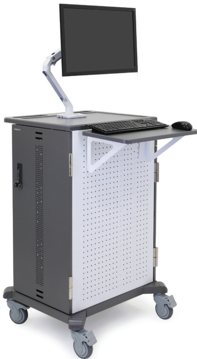
98-381-F56 YES24/36 PEGBOARD SHELF