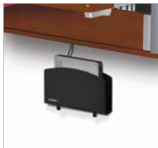
Looking for CPU holder? Try Ergotron's Vertical Small CPU holder. PN: 80-063-200 Accommodates CPUs from 1-3/8" to 3-3/4" (3.5 to 9.5 cm) wide