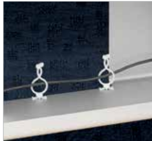
Use included cable management clips to organize and protect your cords