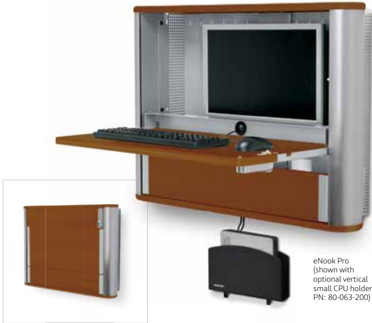
eNook Pro (shown with optional vertical small CPU holder PN: 80-063-200)

If you are space-challenged, then eNook is the workspace for you.