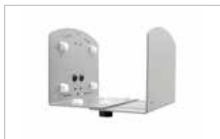
Another option will be Ergotron's Vertical Universal CPU Holder. PN: 97-468-202 Accommodates CPUs from 2" to 8" (5 to 20 cm) wide