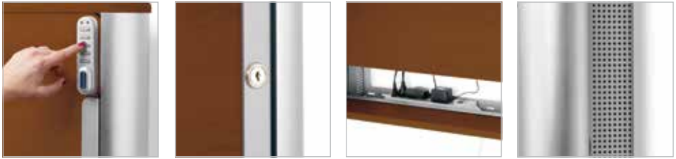
Programmable code lock in eNook Pro records up to 3 combinations for multiple users

This wall-mounted workstation not only stores your equipment behind a secure locked door, but the door flips down for a handy desk. The innovative eNook takes up zero floor space (and only a few feet of wall space!) and earned the Best of NeoCon award from international leaders in product design.