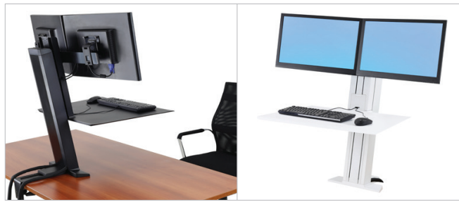
Available in black or white finish