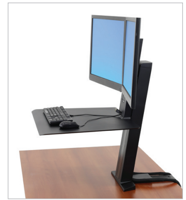
WorkFit-SR design prevents the keyboard tray from intruding into your space