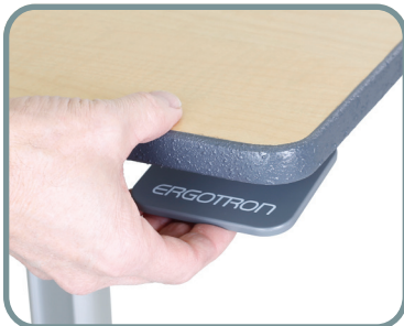
CHOOSE YOUR MOST COMFORTABLE WORKING HEIGHT WITH THE EASY-TO-REACH HANDLE.