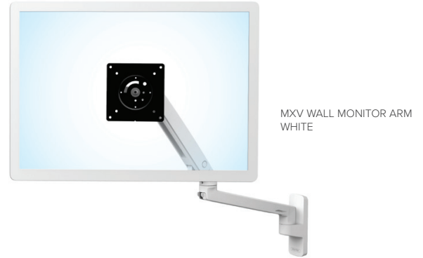
MXV WALL MONITOR ARM WHITE