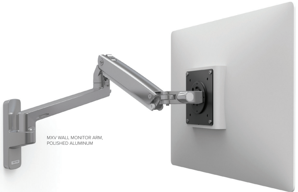
MXV WALL MONITOR ARM, POLISHED ALUMINUM