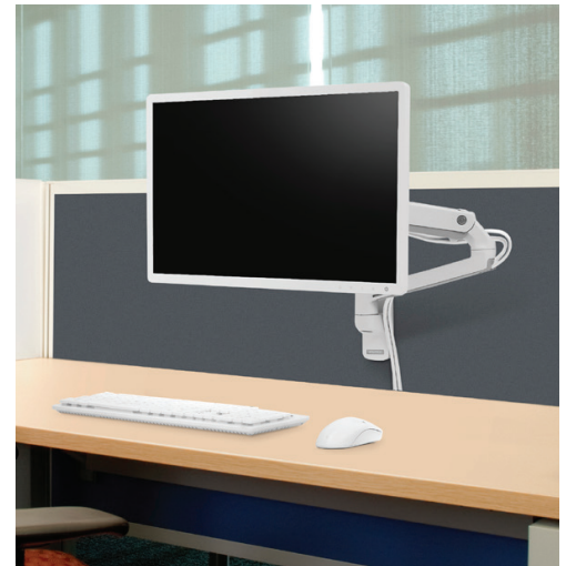
MXV WALL MONITOR ARM WHITE