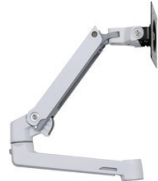
WHITE WITH GREY ACCENTS #98-130-216