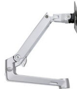
SILVER WITH WHITE ACCENTS #98-130-231