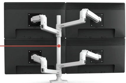
TALL POLE VERSION ALLOWS YOU TO MOUNT UP TO TWO ADDITIONAL DISPLAYS (REQUIRES AN LX ARM, EXTENSION AND COLLAR KIT FOR EACH)