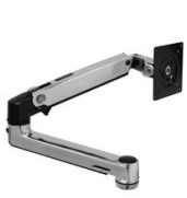
POLISHED ALUMINUM WITH BLACK ACCENTS #97-940-026

REQUIRED TO ADD A THIRD AND FOURTH ARM TO THE TALL POLE VERSION