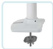
WHITE GROMMET MOUNT KIT ACCESSORY #98-035: ATTACHES THROUGH SURFACE HOLE