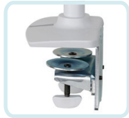
INCLUDED WITH LX DUAL STACKING ARM, TALL POLE: HEAVY-DUTY 2-PIECE DESK CLAMP ATTACHES TO SURFACE EDGE