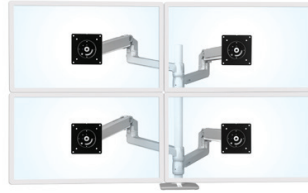
SHOWN WITH TWO LX ARMS, EXTENSION AND COLLAR KITS TO SUPPORT FOUR DISPLAYS