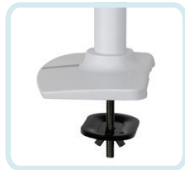
INCLUDED WITH LX DUAL STACKING ARM, TALL POLE: GROMMET MOUNT KIT ATTACHES THROUGH SURFACE HOLE