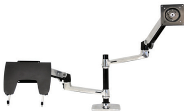
NOTEBOOK TRAY KIT SHOWN ABOVE IS INCLUDED WITH THE POLISHED ALUMINUM LX DUAL STACKING ARM #45-248-026

FOR ALL OTHER LX DUAL STACKING ARMS, THE NOTEBOOK TRAY KIT CAN BE ORDERED SEPARATELY #50-193-200 (AVAILABLE IN BLACK ONLY)