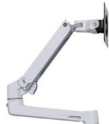
WHITE WITH GREY ACCENTS #98-130-216