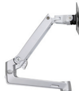
SILVER WITH WHITE ACCENTS #98-130-231