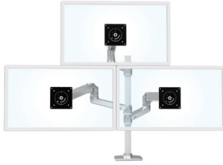
SHOWN WITH ONE LX ARM, EXTENSION AND COLLAR KIT TO SUPPORT THREE DISPLAYS