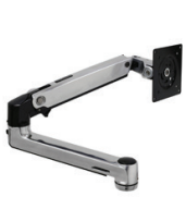
POLISHED ALUMINUM WITH BLACK ACCENTS #97-940-026