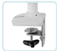
INCLUDED WITH LX DUAL STACKING ARM: STANDARD 2-PIECE DESK CLAMP ATTACHES TO SURFACE EDGE