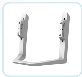
RECOMMENDED ACCESSORY: LX DUAL DIRECT HANDLE KIT 98-037-062