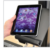
Tablet/Document Holder for WorkFit-S 97-558-200 (black) Includes lift handle