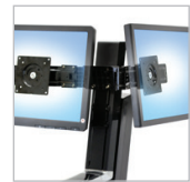
Hinged Bow for WorkFit-S 97-583-009 (black)