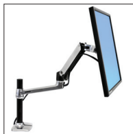
Flat Panel Monitor Arms