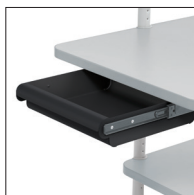
Small 3" Drawer