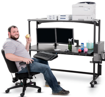
Top: Carlos's 60" w AnthroCart in Fog helps maximize his workspace. Bottom: Marcus's 60" w AnthroCart in Black keeps everything within arms reach, shown with optional CPU SideRack, Keyboard and Mouse Caddy, Extension Tubes and Small Additional Shelf.