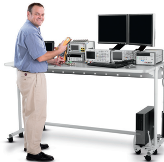
Top: The 72" w AnthroCart in Fog makes efficient use of larger spaces. Bottom: After selecting a 72" w AnthroCart in Fog to hold all of his test equipment, Brady added Extension Tubes so he can work standing. Shown with optional CPU SideRack, and Extension Tubes.