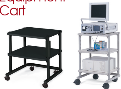
On the right: Keep your small equipment on the move with a compact mobile Equipment Cart. Shown in Fog with optional Additional Small Shelf.