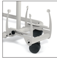
CPU SideRack with Caster