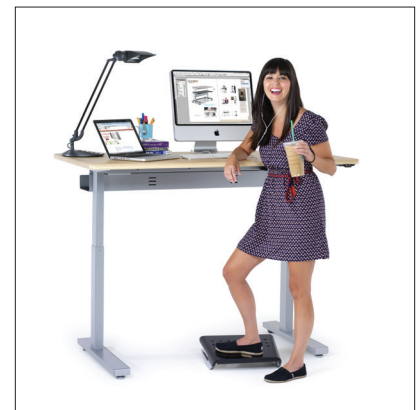
Elevate II Single Surface

For inquiries, call our super friendly and knowledgeable Sales Team at 800.325.3841 , drop us a line at sales@anthro.com , or download more info at anthro.com .