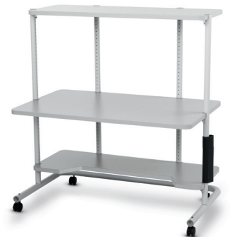
Top: Jessica's 48" w AnthroCart in Black is roomy enough for all of her equipment. Shown with optional Small 3" h Drawer and FileAround. Bottom: Add storage to any AnthroCart with optional Extension Tubes and Additional Shelves.