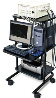
Top: Kyle's 36" w AnthroCart in Black sports an optional CPU SideRack, Extension Tubes, Keyboard Drawer and Small Additional Shelf. Bottom: The perfect building blocks, AnthroCarts are easy to configure for your equipment, shown with optional Small Additional Shelf.