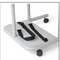
Metal Base Shelf