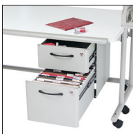
6" and 11" File Drawer