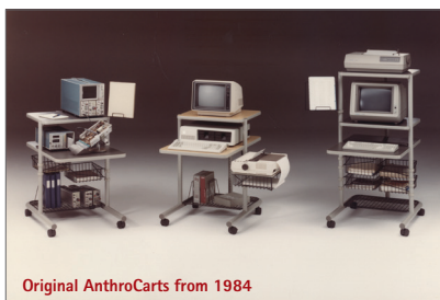
Original AnthroCarts from 1984

Sturdy 1" thick industrial grade high density particle board shelves, 16 gauge steel tube legs and our patented shelf support mechanism means AnthroCarts can hold up to 150 pounds of your equipment!