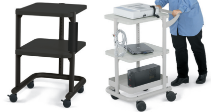
On the right: Add the optional Handle, Equipment Hold-down, Metal Bin and 4" Casters for a nimble cart that can maneuver through tight spaces.