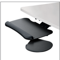
Keyboard and Mouse Caddy