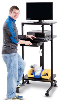
Top: The 24" w AnthroCart in Fog makes a compact desk for laptops. Bottom: Beau's 24" Cart in Black is durable enough for manufacturing environments. Shown with optional Extension Tubes, Small Additional Shelf and Small 3" h Drawer.