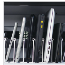
Mix and match devices — the interior is yours to configure.