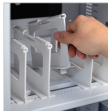
Pop-N-Go Bays are so easy to adjust; simply pop them out of place and position them at any width in .3" increments