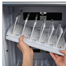
Adjusting the Lift-N-Set Shelves is simple and intuitive. Position them at any height in 2/3" increments.

The YES Basic Cart fits ALL shapes and sizes with screens up to 13" – and some up to 14" – with and without cases. Mix and match Chromebooks and Ultrabooks with tablets, e-Readers and hand-helds. It's completely up to you. The YES Cart truly is the last cart you'll ever buy.