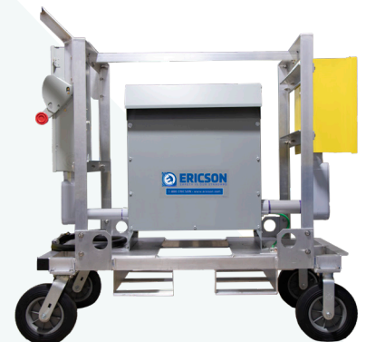
30-75kVA, 4-Wheel PTU