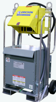
30-45kVA, 2-Wheel PTU