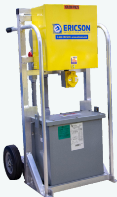
15kVA, 2-Wheel PTU