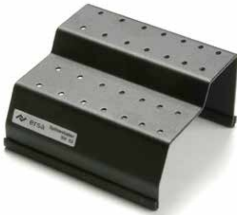
SH 03 - tip holder, unequipped