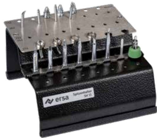
SMD 8015 - tip holder OSH11 with adapter

The tip holder SMD 8015 is equipped with the latest soldering tips or desoldering tip pairs, in particular for SMD technology.