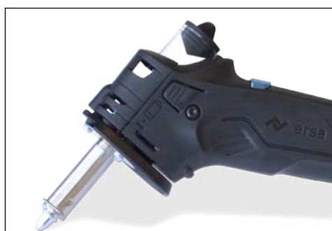
Transparent solder container