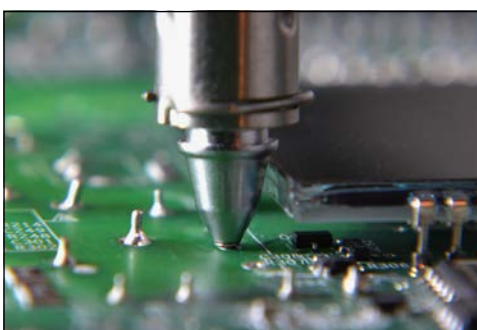
Slim desoldering tip for optimal contact to the solder joint