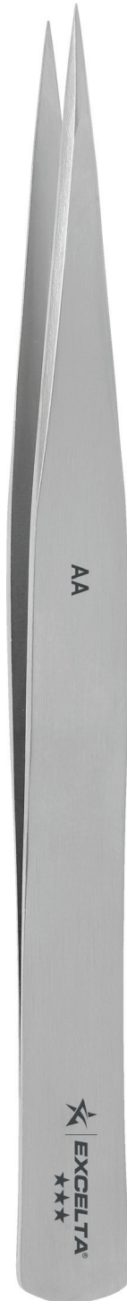
C.T.M. Critical Tip Measurements (Tip Width and Thickness of one point)